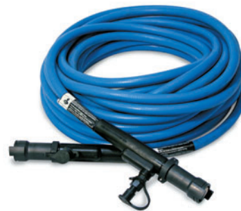
ProHeat liquid-cooled induction heating cable shown.

Designed with flexibility in mind, the ProHeat liquid-cooled induction heating cables can be wrapped into coils of various shapes and sizes to fit almost any induction heating application. Great for applications with geometries and temperatures that prevent the use of air-cooled blankets.